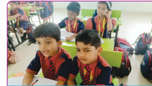
Traditional Classroom Learning