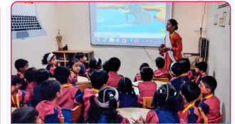
Digital Learning (Technology Integration)