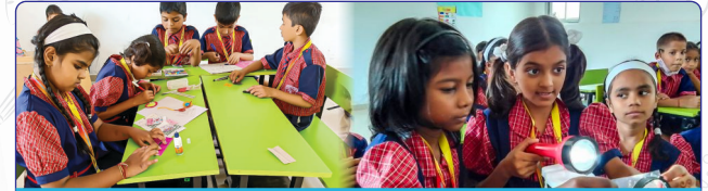
Interactive & Activity Based Learning